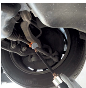
Releases steering linkages