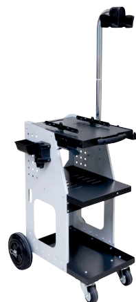
PN. 051331 + 052284 UNIVERSAL 800 + Over hanging arm