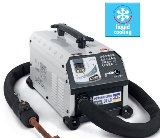
Supplied with a complete inductor 90°